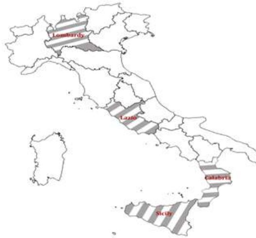
Figure 1. Regions in which the research has been carried out